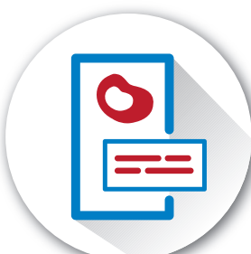
Tissue / FFPE