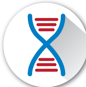
Methylation / CFC DNA